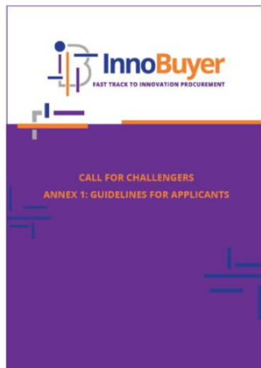
Annex 1: Guidelines for applicants