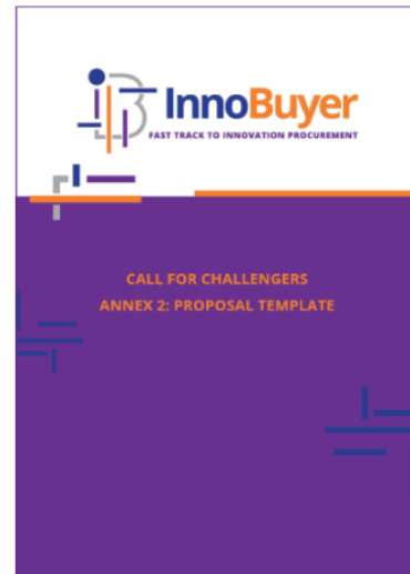
Annex 2: Proposal form